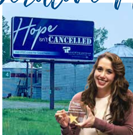
Won 1st place for Hope Isn't Canceled Billboard/Video Campaign National Spotlight on Excellence Contest